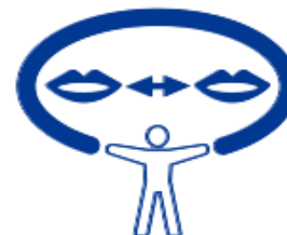
Speech and Language Therapists